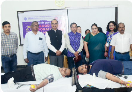
Blood Donation camp in collaboration with Red Cross and Young Indians (YI) where we have collected 90 units blood.