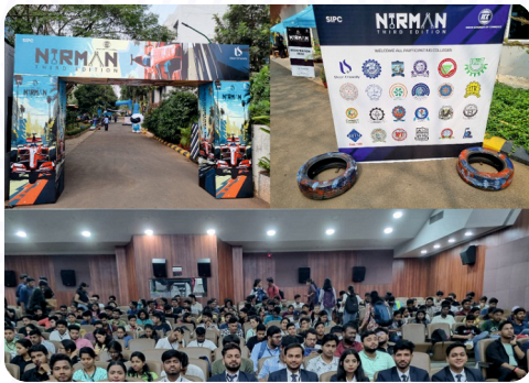
IMBA Students participated in "Ideathon" at Nirman organized by Silicon University of Technology, Bhubaneswar on 19.02.2024.

BIITM students attended Entrepreneurial Ideathon- Round 2 (E- Summit' 24) IPL auction, Engima and E-Summit organized by the IIT Bhubaneswar on 04.02.2024.