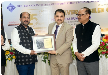
Felicitated Alumni and Corporate leaders.