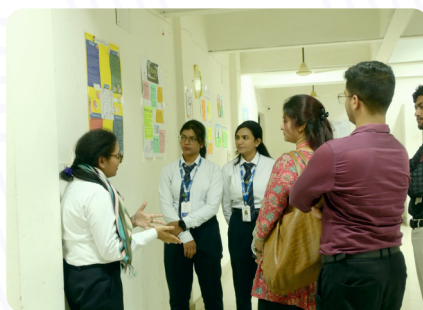
BIIT-MIC organized a Poster competition on 22.04.2024.