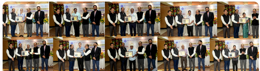
Long Service awards for employees of BIITM.