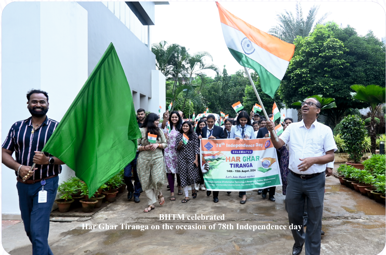
BIITM celebrated Har Ghar Tiranga on the occasion of 78th Independence day