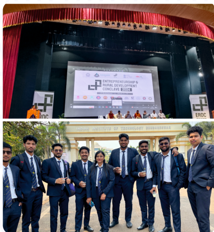
NSS Volunteers participated in "Entrepreneurship & Rural Development Conclave 2024" organized by IIT, Arugul, Jatni Road Bhubaneswar on 12.03.2024.