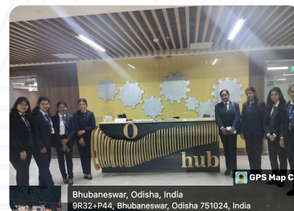
Students participated in "START UP Odisha" and "FICCIFLO" in collaboration - Workshop for "Aspiring Women Entrepreneurs" in O-Hub Bhubaneswar on 12.03.2024