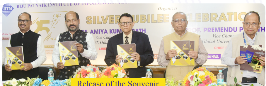
Release of the Souvenir.