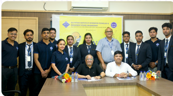
BIITM organized Udyami Chintana-2024 the Intra-College Ideathon competition for IMBA and MBA students in association with Alum Networks Pvt Ltd. on 07.10.2024.