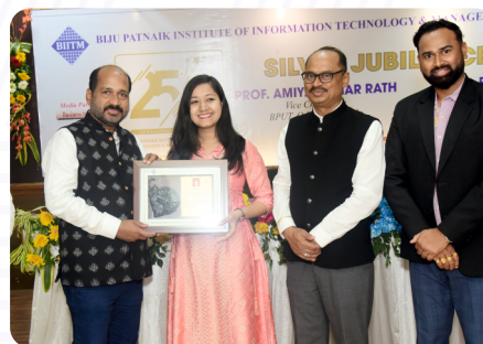
Felicitated University Gold Medalists of 2018-19, 2019-20, 2020-21 & 2021-22 batches.