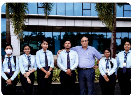
IMBA 3rd semester students attended a Boot Camp on "Innovation and Entrepreneurship" at Odisha Hub organized by Young Indians (YI) on 12.07.2024.