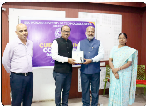
During September 2024 the Principal of BIITM was nominated to the Advisory Committee for AIU Academic and Administrative Development Center (AADC), BPUT, Odisha.

Recognizing the committed and sincere efforts of BIITM, BPUT has entrusted BIITM with some important responsibilities as mentioned below: