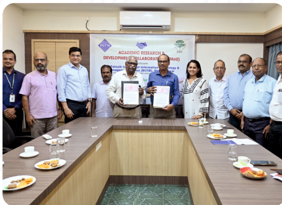
MOU with Centre for Environment Development (CED) Development (CED)

BIIT-MIC has signed MOUs with some reputed incubators in Odisha in 2023-24.