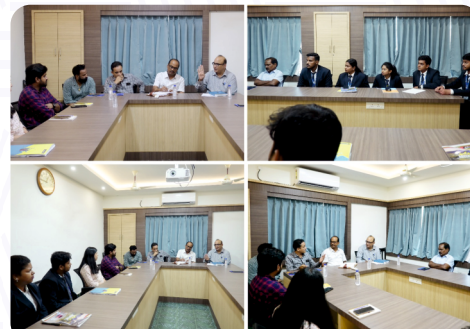
Institution Innovation Council meeting was held by the Principal with BIIT-MIC Coordinator on the 28th of March 2024.